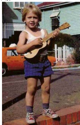
Young Keith Urban (age 4) with his guitar toy